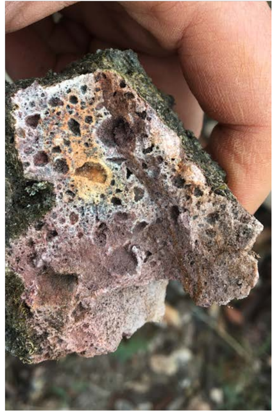
Photo 1 (left) Trenching at La Gloria. Photo 2 (right) Strong vuggy silica alteration of tuff grading 9.1 g/t gold