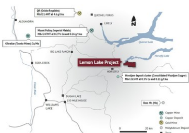
Figure 1 - Lemon Lake location map*

The property is located close to infrastructure with nearby power and road access across the project.