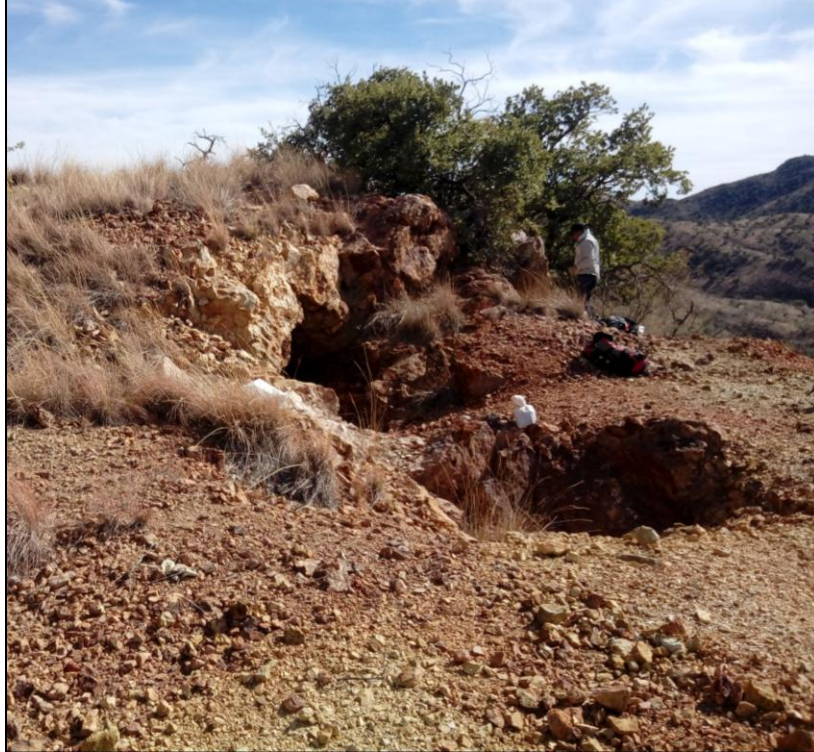
Photo 1: Channel sample that returned 1.4 metres grading 6.81 g/t gold, 927 g/t silver