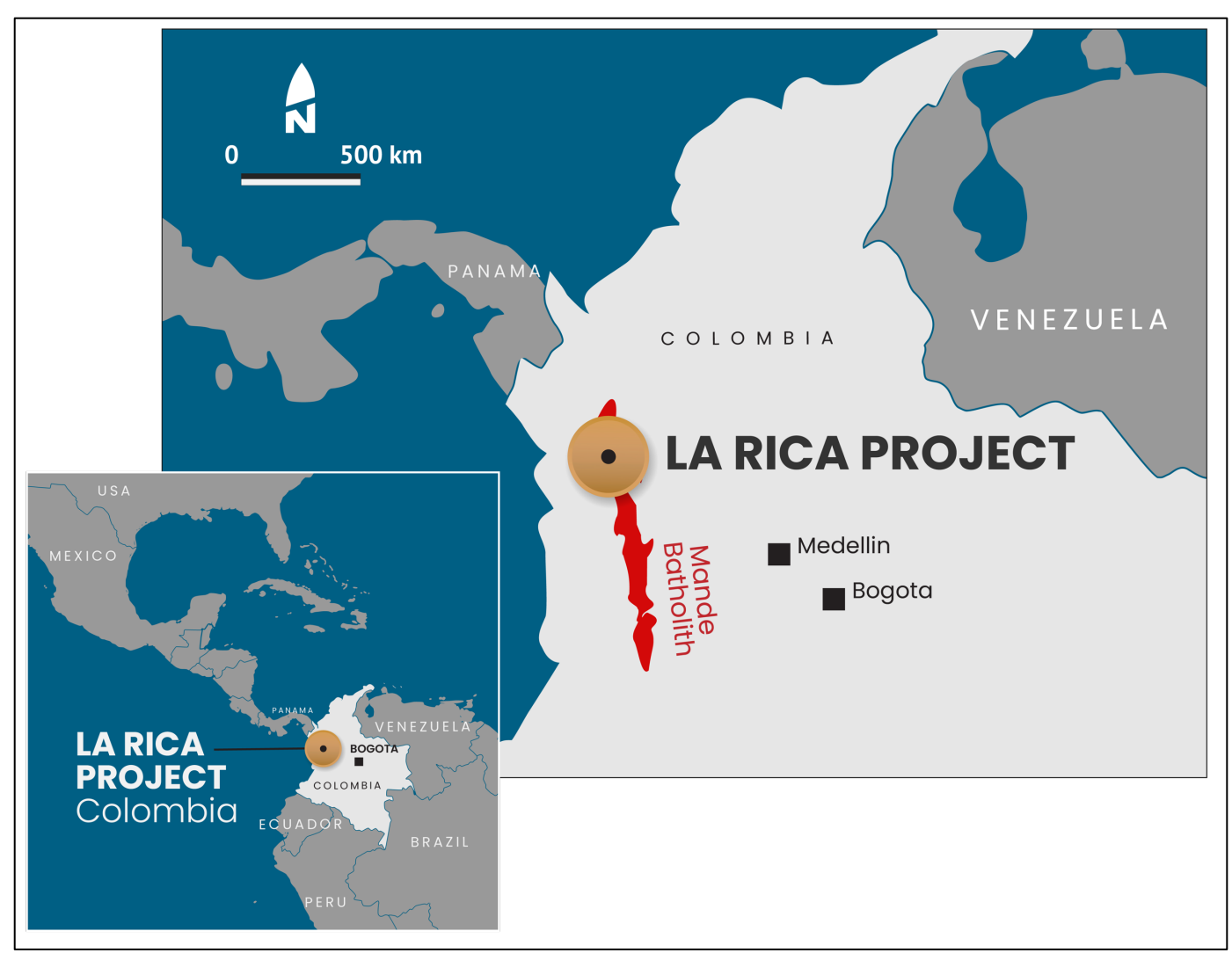
Figure 1 — La Rica location in the Mande Batholith in Colombia

The La Rica project hosts an elongate cluster of porphyry copper-gold centres containing at least four distinct porphyry centres. The outcropping mineralization comprises chalcopyrite, bornite and gold and occurs in quartz diorite porphyries with intense potassic alteration and hydrothermal magnetite. A large soil geochemical grid combined with rock and stream sediment sampling over the La Rica target displays fifteen kilometres of copper anomalism entirely within Orogen's AOI (Figure 2). The namesake La Rica zone became a focus of early work with rock sampling, 118 samples, over an area of 500 metres by 600 metres averaging 0.76% copper and 0.47 g/t gold coincident with a historic IP chargeability anomaly. There has been no historic drilling on the La Rica property.